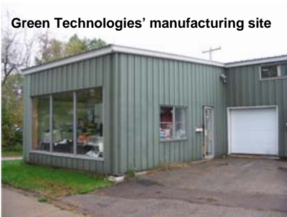
Green Technologies' manufacturing site